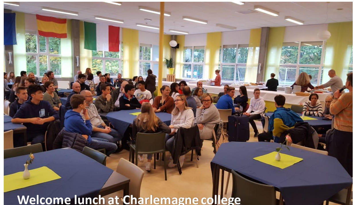
Welcome lunch at Charlemagne college