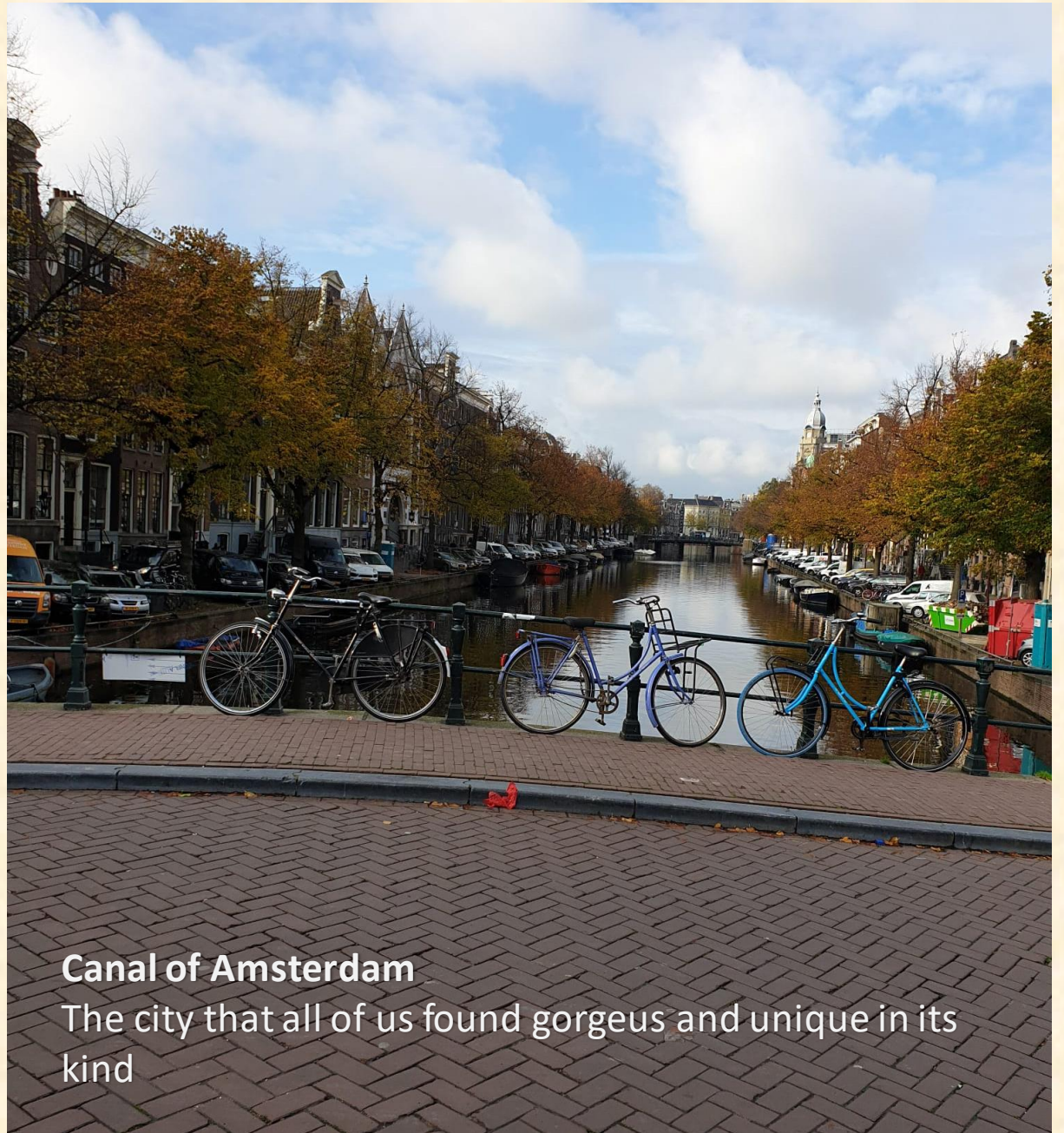
Canal of Amsterdam

The city that all of us found gorgeous and unique in its kind