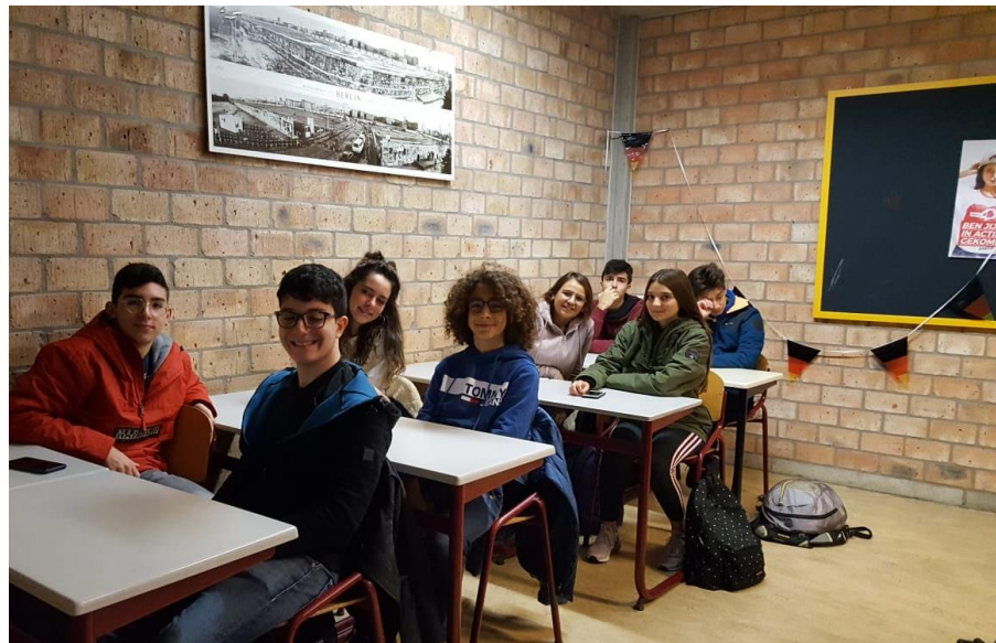
Lesson about the Dutch school system

We had a really good time visiting the mine and learning what the Life of a Miner is about