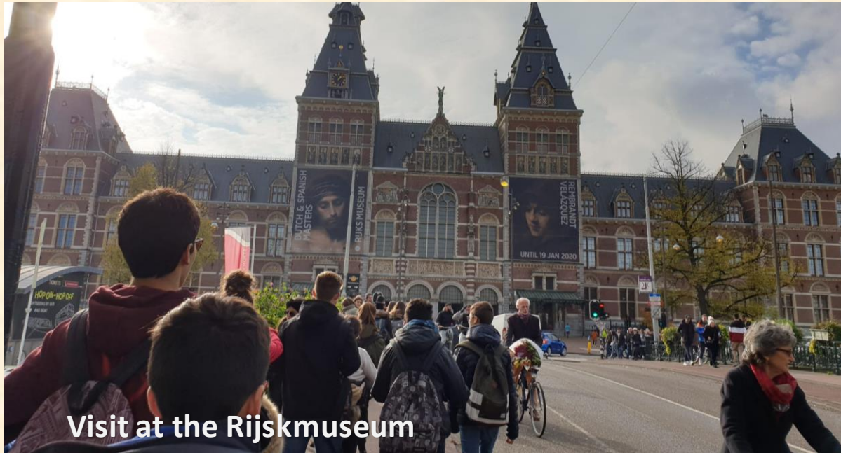
Visit at the Rijksmuseum