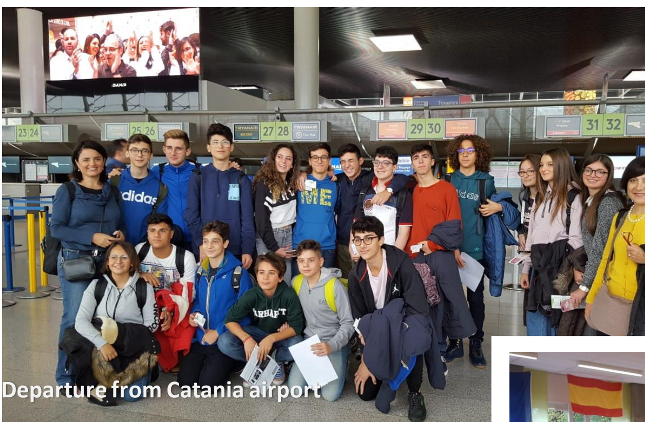
Departure from Catania airport