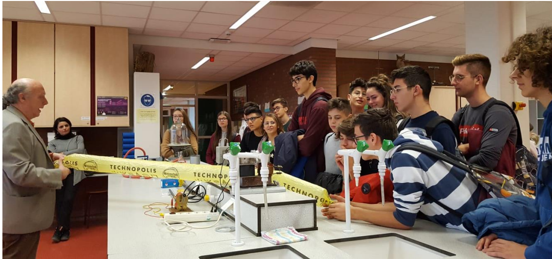
Physics and Chemistry experiments